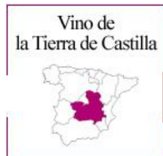
VINO DE LA TIERRA DE CASTILLA